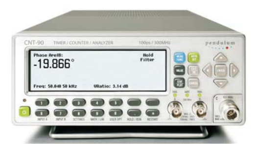
Figure 1: Display showing phase value, frequency, attenuation V_A/V_B , and auxiliary parameters.

When adjusting a frequency source to given limits, the graphic display gives fast and accurate visual calibration guidance.