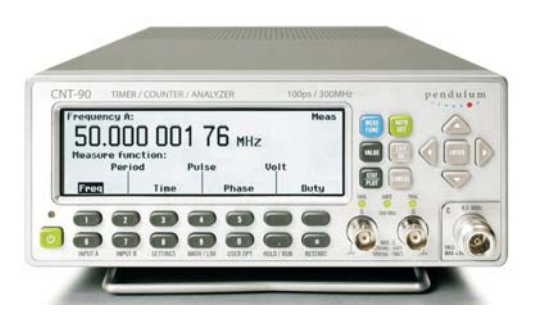
Figure 2: Measure function selection menu, shown with measured results.