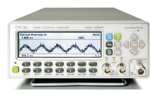
Figure 5: Display showing the trend (signal over time) of sampled data.