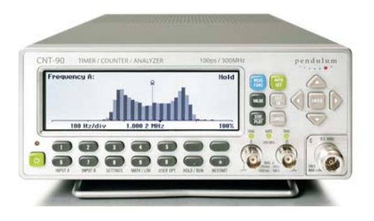
Figure 6: The same result as in figure 5, now displayed as a histogram.