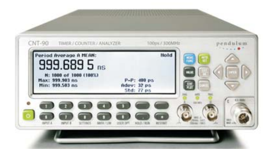
Figure 4: Display showing different statistical parameters viewed at the same time.