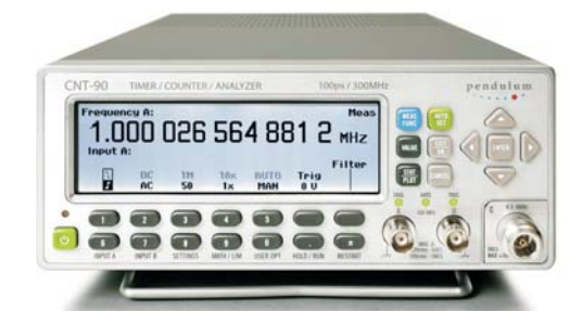
Figure 3: Input parameter setting menu shown with measured result.